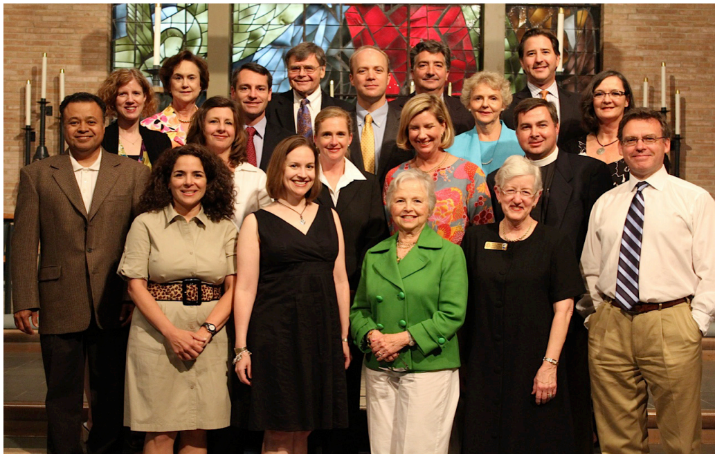
St. Luke's Episcopal School 2010-2011 Board of Trustees